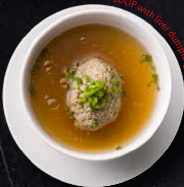
BEEF SOUP with liver dumplings