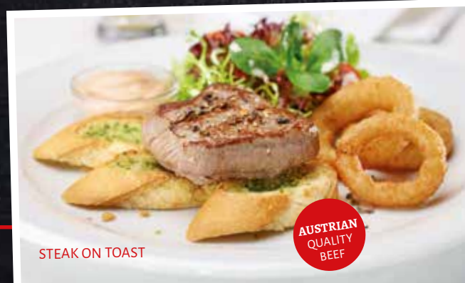
STEAK ON TOAST