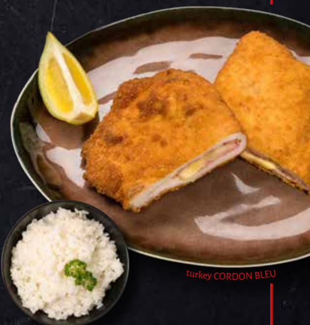
turkey CORDON BLEU