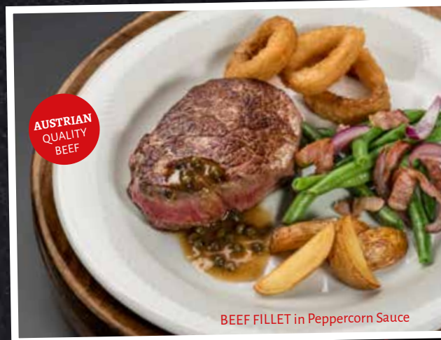
AUSTRIAN QUALITY BEEF